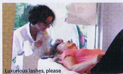
Luxurious lashes, please

The eyes are the window to the soul—and the focus of this fall's big makeup trend, the smoky eye. To perfect the look, long lashes and neat brows are a must. Head to The Lashe Spot , the city's only salon specializing in eyelash and eyebrow grooming and maintenance. Of special interest are the OutLashe semi-permanent eyelash extensions, customized by a technician to flatter individual eye, brow and face shapes to create a surprisingly dramatic effect that lasts for 60-90 days. The salon also offers lash and brow tinting, brow waxing and shaping, and even lash perms for that subtle curl. Can't decide? Pick one of the packages for a total eye makeover. $30-$500. 24 W. Erie St., 312-863-7678, www.lashespotchicago.com .